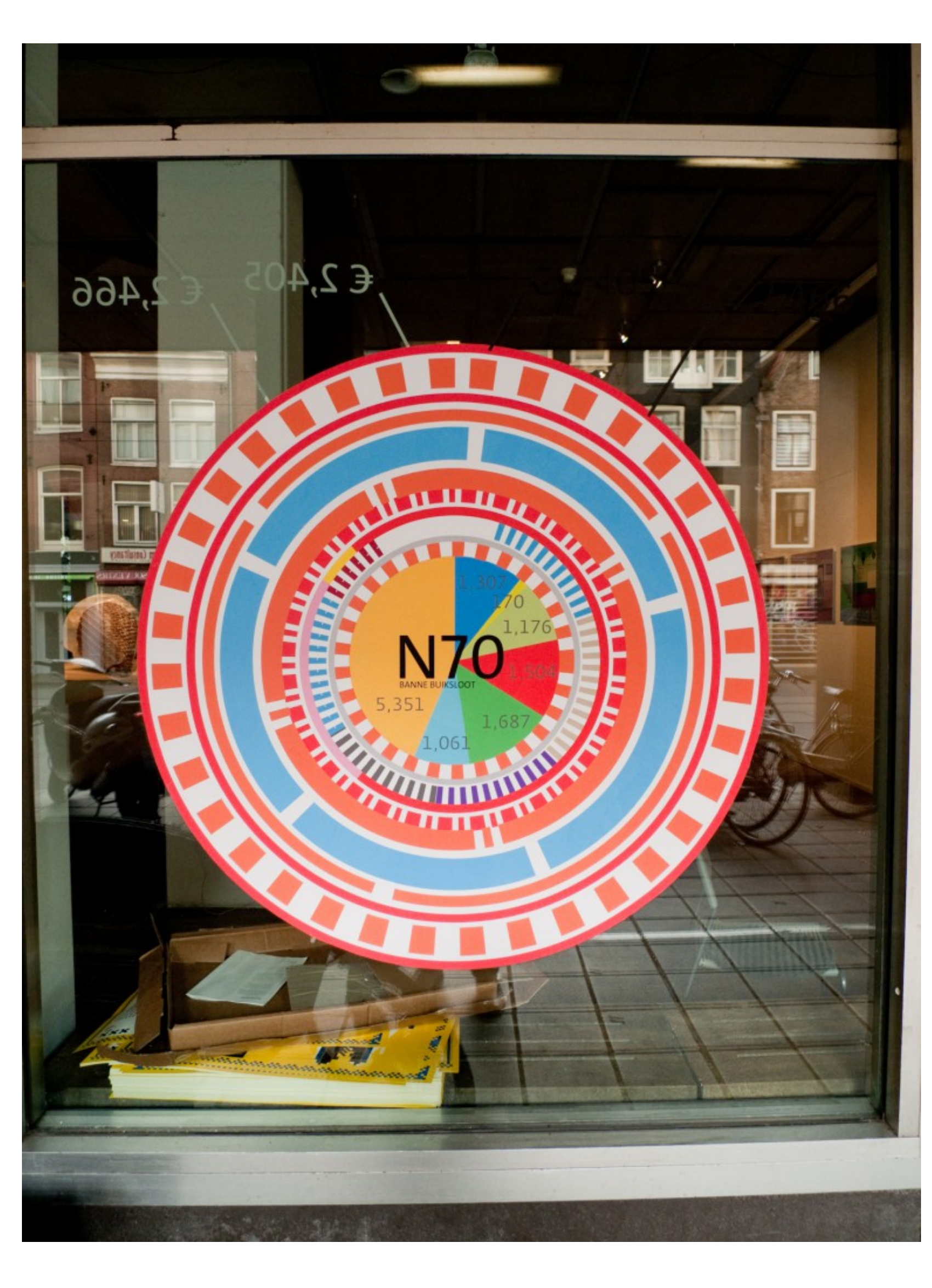
Residential Construction Academy HVAC Downloads Torrent